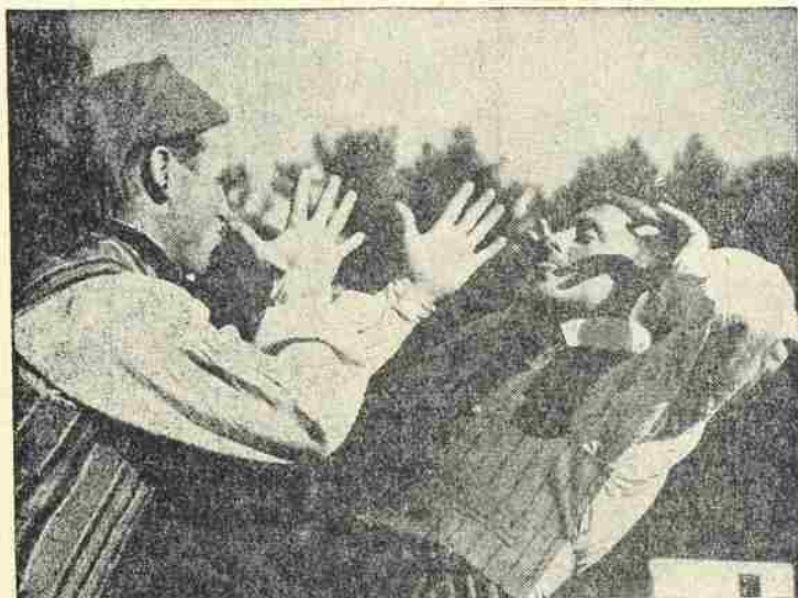
Members of the Danish gym team who are performing in the Willamette gymnasium tonight.

The Danish gymnasts, whose ages range from 18 to 24, will stay in campus living organizations tonight. The men and women travel by car and a truck carries their equipment. Cost for the entire trip will be paid by proceeds from performances.