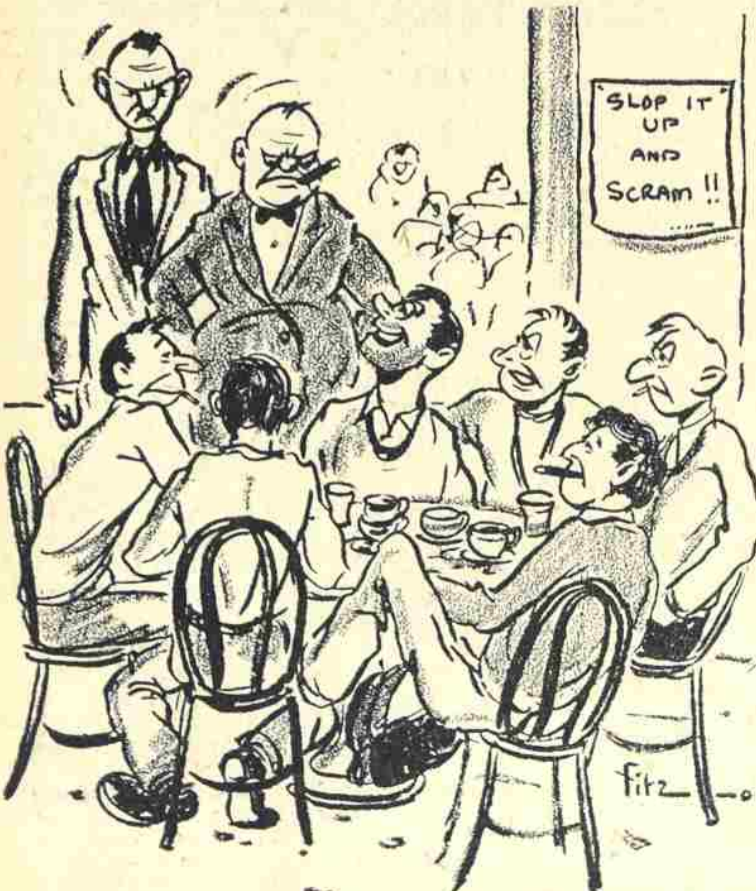
Stick around, Governor, we have a class in twenty minutes.