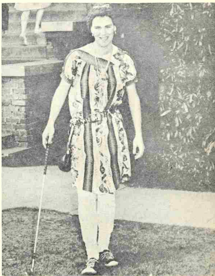
Could this be our illustrative sports editor? Why has he suddenly taken to feminine apparel? Of course any resemblance to the best dressed coed on campus is purely coincidental. Looks like the society editor wasn't the only one to lose!