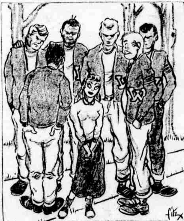
Fellows, Why do you suppose I didn't wear my hat?

To sum it all up, be choosy, be brief, and be on good terms with that fat ugly girl in the front row.