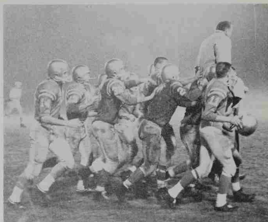
Team Hoists Coach After C of I Mix.

Willamette coaches are generally close-mouthed; but, then, most of their players would agree that talking about a ball game has never won it. The record speaks for itself and commends the coaches who mastermind the season one win at a time.