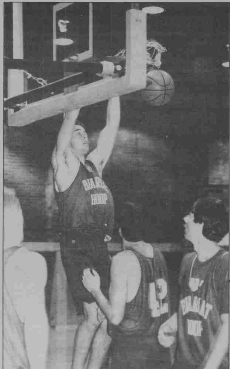
After a disappointing season last year, finishing second from the bottom, the men's basketball team is working hard in their practices. Tonight the Bearcats will battle Linfield's Wildcats on Willamette's home court, who graduated three starters last year.