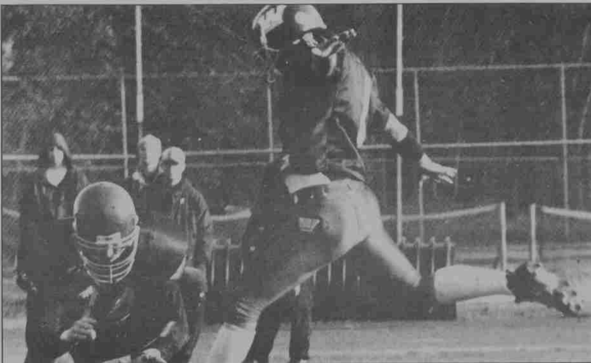
This season's record setting Bearcats begin play with a kickoff. They will battle Western Washington on Saturday.

yards passing in the game to a team which is known for its passing game. Despite giving up yardage, the team held Bethany to 20 points below its average.