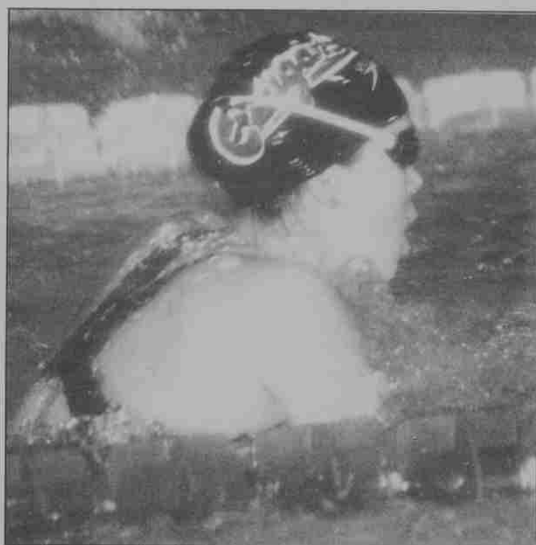
A swimmer practices her breaststroke in preparation for the season.