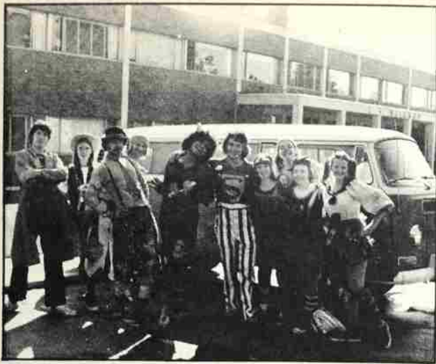
Godspell cast... photos by McNutt