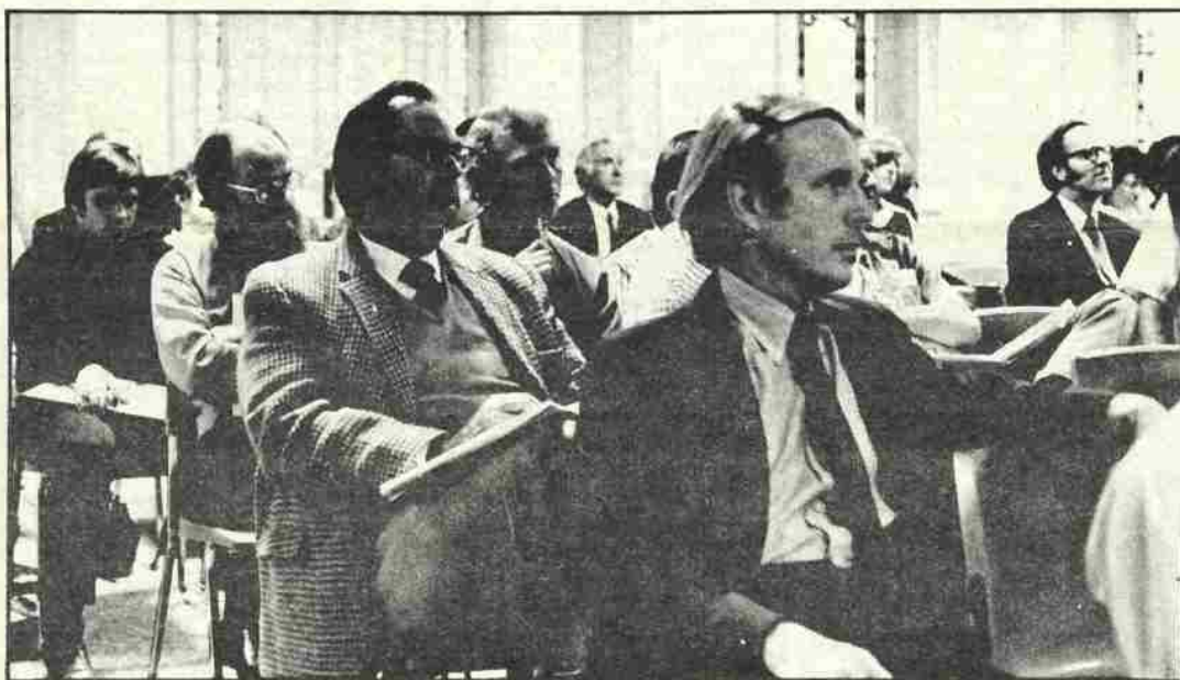
Faculty members listen intently to debate on the proposed Personnel Policies and Procedures. Consideration of the report continued through Tuesday's session.