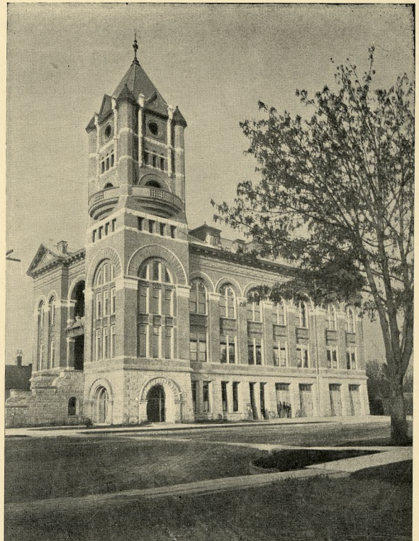
Salem City Hall

The major emphasis of the curriculum in Public Administration is upon political science, public law, economics and business administration. Courses in biology, literature, philosophy, ethics, mathematics, sociology and religion should have liberal allowance in the student's elective program. The following required courses are of primary importance in attaining the objectives of the curriculum.