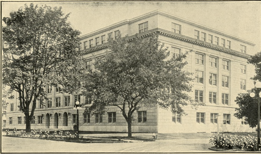
Oregon State Office Building