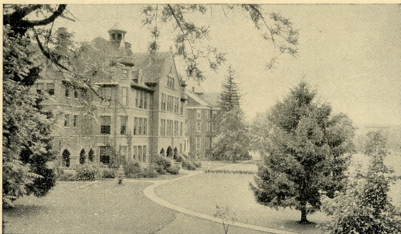
View of Willamette University Campus Showing Eaton and Waller Halls