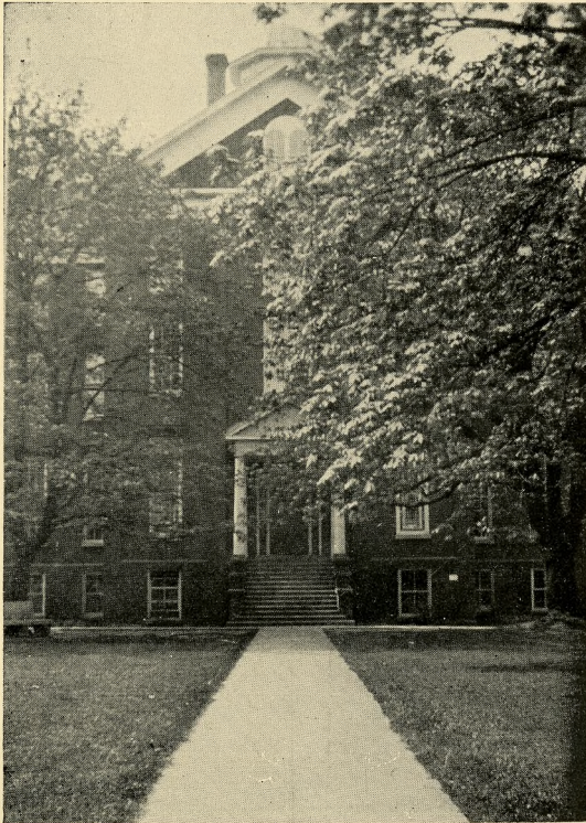
Waller Hall, Home of the College of Law Willamette University