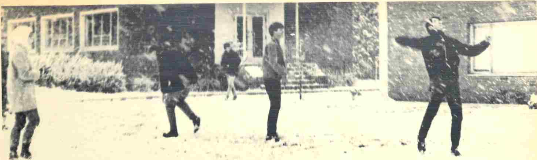
'Let It Snow! Let It Snow!'