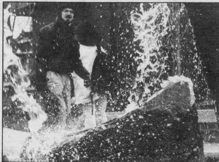
Icicles form on the Hatfield fountain this week as temperatures dipped to 26 degrees F during the day. Hopes of snow waned during the week when it never materialized. The weather should warm this weekend with rain in the forecast.