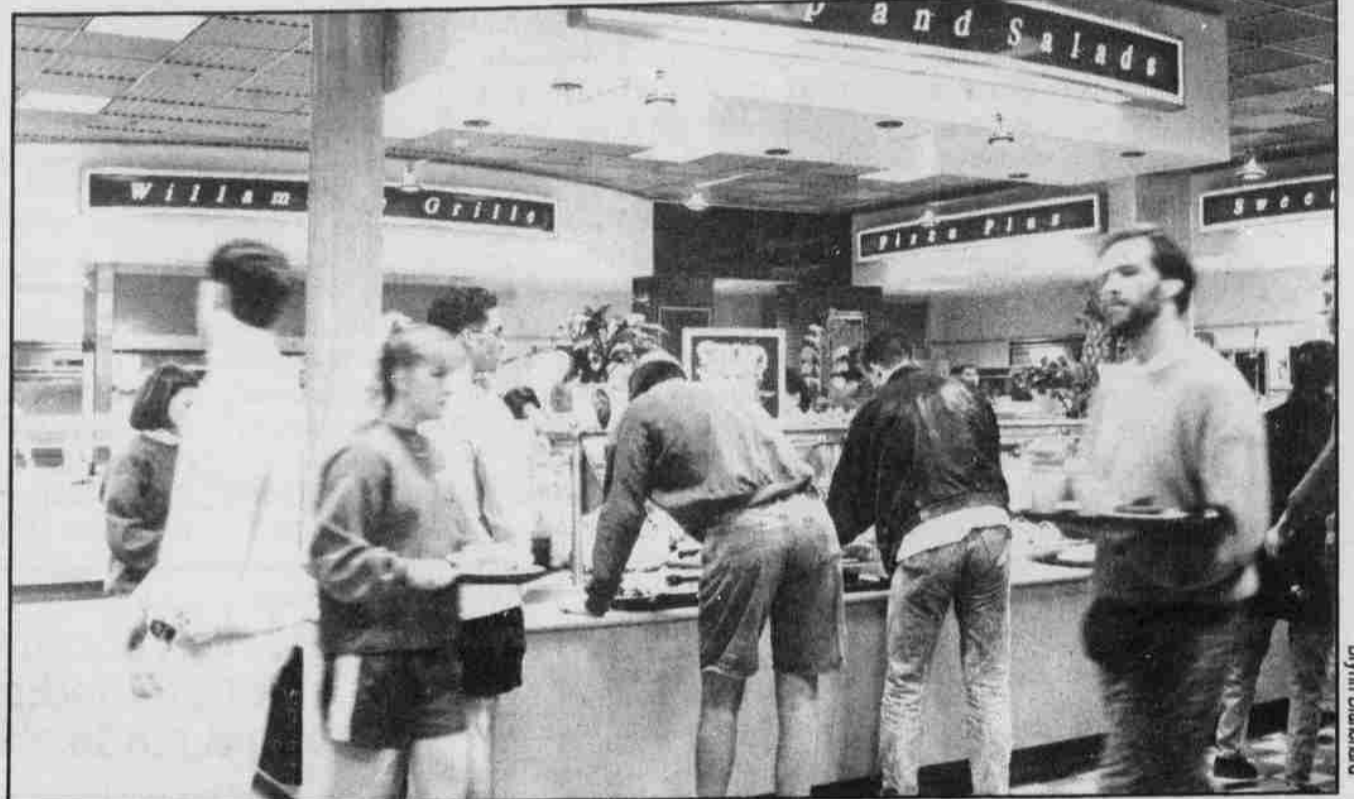
Goudy Commons will be the subject of an upcoming brochure to explain its features.

"The point of the brochure is to clarify and explain the meal options to students so that they don't have to worry when they get here." The brochure will also be made available to other individuals. Wilbur commented, "This brochure will also be available for parents, graduate