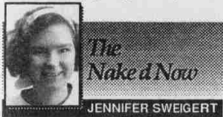
The Naked Now

As a friend of mine said last night, my believing in him is not going to influence the course of events one way or the other, so why not believe? My suggestion to Clinton, to convince those less gullible than myself, is that he volunteer to take a 50 percent pay cut. Not that an extra $100,000 would put a very big dent in the deficit, but it would be an inspirational gesture, and might even guilt-trip the Congress into not voting themselves another pay raise.