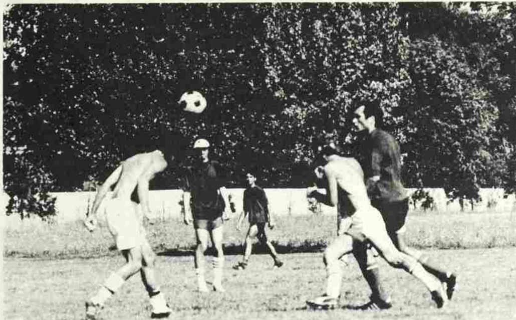
A Willy U soccer player passes the ball off his head as Willamette soundly defeated Reed College last Saturday 2-1 at Walker Field.