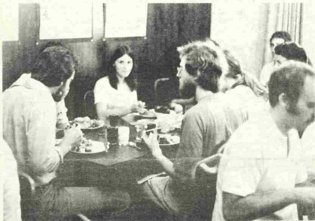
Willamette students are enjoying the SAGA food experiment. The program is a new nutritional meal plan. About 45 students eat their nutritionally satisfying meal at Doney Hall.