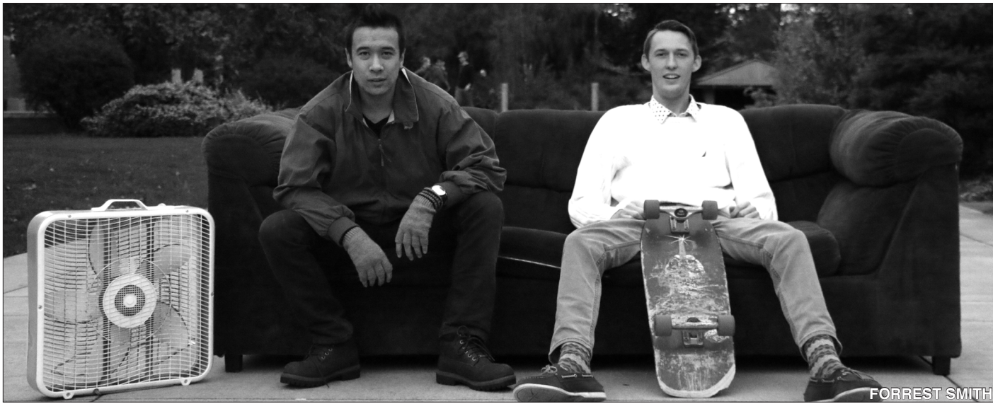
Cathode makes it big in the viral world.