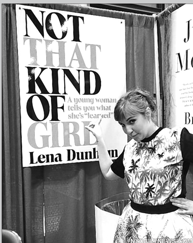
Tastes change, and that’s normal.