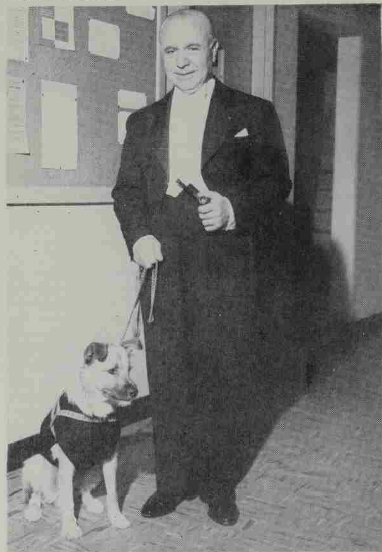
Jose Iturbi's recent appearance on the Willamette campus thrilled a filled auditorium. One Salemite expressed the sentiment of the audience in a letter to the STATESMAN when she said "... Hours like Mr. Iturbi gave us are divine . . . appreciate it with every corner of your heart, relish it and feed on it for a long time."

Willamette's Distinguished Artists Series is now in its seventh year of sponsorship by the student managers of ASWU.