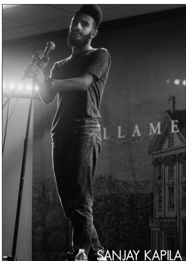
Poet takes poetry to the next level.