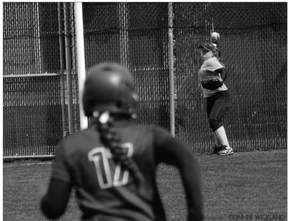
WU Softball faced the George Fox Bruins last weekend and went 2-2 in the series.