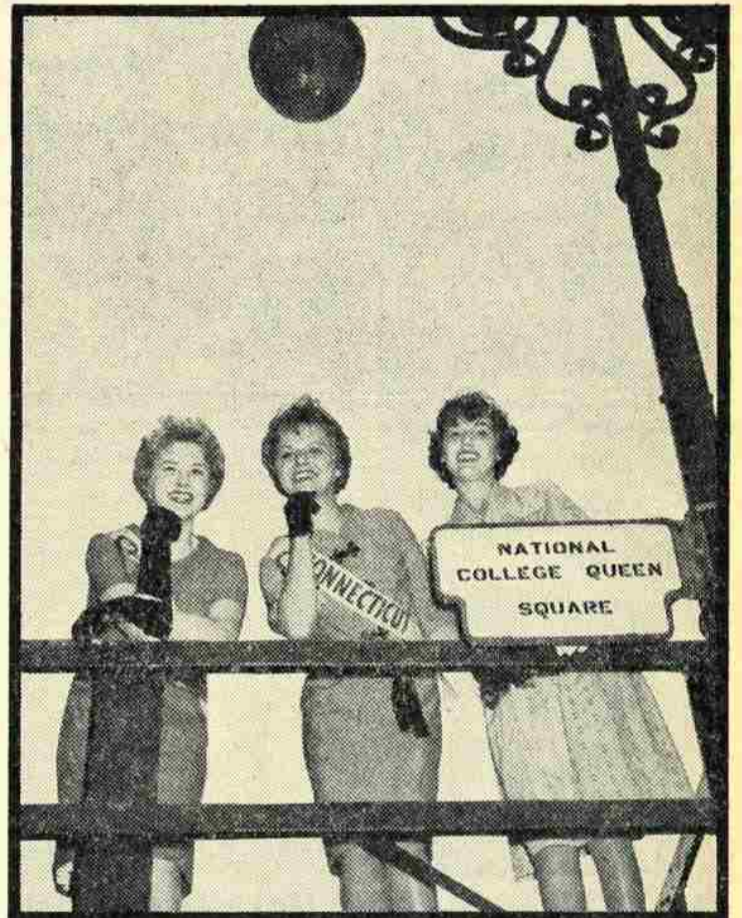
Times Square becomes National College Queen Square