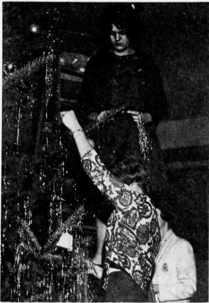
In addition to their halftime performances at games, Honeybear members find time each year to decorate the Christmas tree in Eaton Hall. Putting the finishing touches on this year's tree are three of the freshman members of the group.