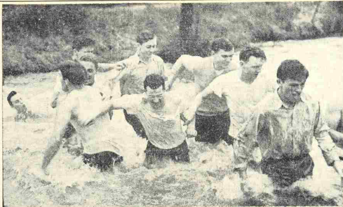
Bedraggled Glee losers wallowed in the icy mill stream Monday and concluded that swimming season had not yet arrived. The frigid water brought many vows to practice harder next year.