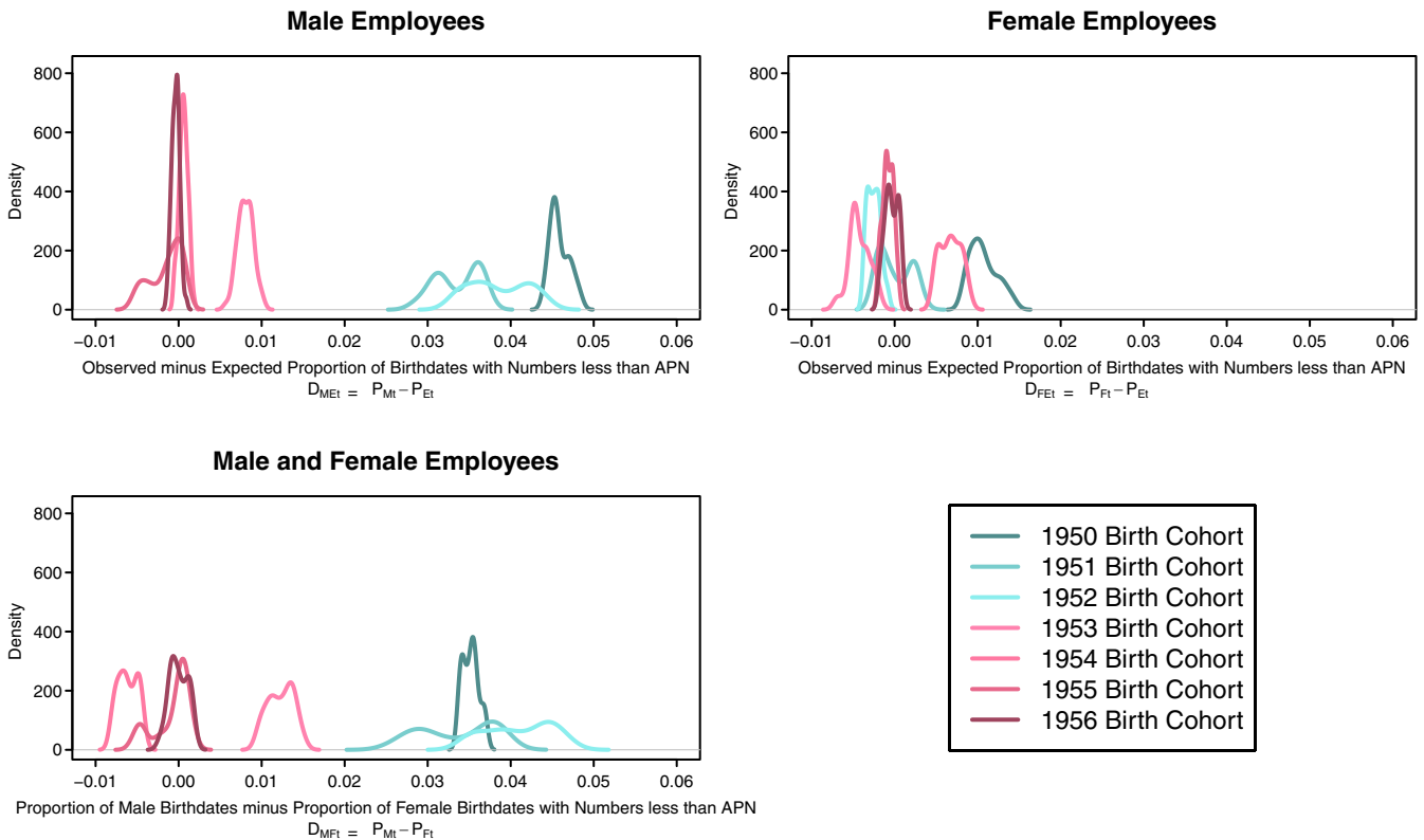
Fig. 1. Distribution of calculated effects across all months of the CPDF, June 2011 to March 2016. This figure presents kernel density plots showing the distribution of D_{ME,t} = P_{M,t} - P_{E,t} ( Upper Left ), D_{FE,t} = P_{F,t} - P_{E,t} ( Upper Right ), and D_{MF,t} = P_{M,t} - P_{F,t} ( Lower Left ), by annual birth cohort, calculated using each monthly archived version of the CPDF. In Upper Left , distributions of D_{ME,t} test closer to 0 for birth cohorts with numbers that were not called for induction (1953 to 1956) than for male birth cohorts that experienced the call of lottery numbers (1950 to 1952). Distributions of D_{FE,t} congregate near 0 for all birth cohorts ( Upper Right ), which is consistent with the fact that females were not eligible for the draft lotteries. The distributions of D_{MF,t} diverge substantially from 0 for the 1950 to 1952 birth cohorts but not for the 1953 to 1956 birth cohorts ( Lower Left ).

These results indicate a link between lottery numbers and civilian public employment. However, they rely heavily on the assumption that the APN cutoff value was administered accurately and uniformly. That said, errors in the administration of the induction call may have meant that adherence to the APN cutoff was more variable in practice than was stated in policy. Accordingly, we examined whether the substantive interpretation of the findings—namely, that the VSSL influenced the ranks of executive branch employment—remained valid even when the APN cutoff did not figure prominently in the study design. To do so, we examined the relationship between the numerical value of RSNs assigned to federal employees and the number of employees holding the birthdates associated with those RSNs.