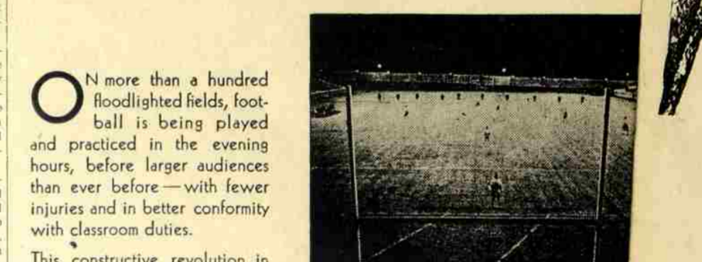
Night photograph of Temple Stadium, Philadelphia, Pennsylvania floodlighted with G-E projectors

ON more than a hundred floodlighted fields, football is being played and practiced in the evening hours, before larger audiences than ever before—with fewer injuries and in better conformity with classroom duties. This constructive revolution in athletics is largely the work of college-trained engineers— young men personally familiar with the needs of college and school. They are dedicating the technical experience gained in the General Electric Test Department to the practical service of undergraduate athletics—designing and installing floodlighting equipment for virtually every sport—football, baseball, hockey, tennis, and track.