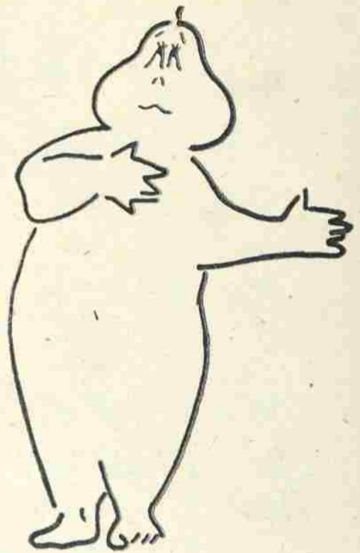
I'm learning to do the Sadie Thompson Hop

But there are humorous petty things you can do when not on weekend pass to make the time pass more easily. Joking is a way and plenty of it is done, about officers and about things we've done or heard. Some of that is really crazy! Also, we get so we walk, instead of run, to formations; and talking or scratching your ear when you are supposed to be at attention is an interesting pastime and doesn't involve court martial or even detail if you get caught. And that double timing—it can go lots easier if you just turn your thoughts home. Besides, the army does double time you into a physical specimen of some note—even if you do end up muscle-bound.