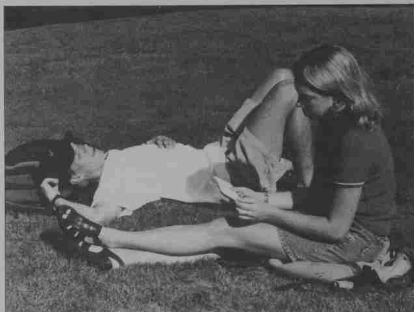
Last days of summer

Forget the stereotypical images of white walls, straight jackets and leather couches.