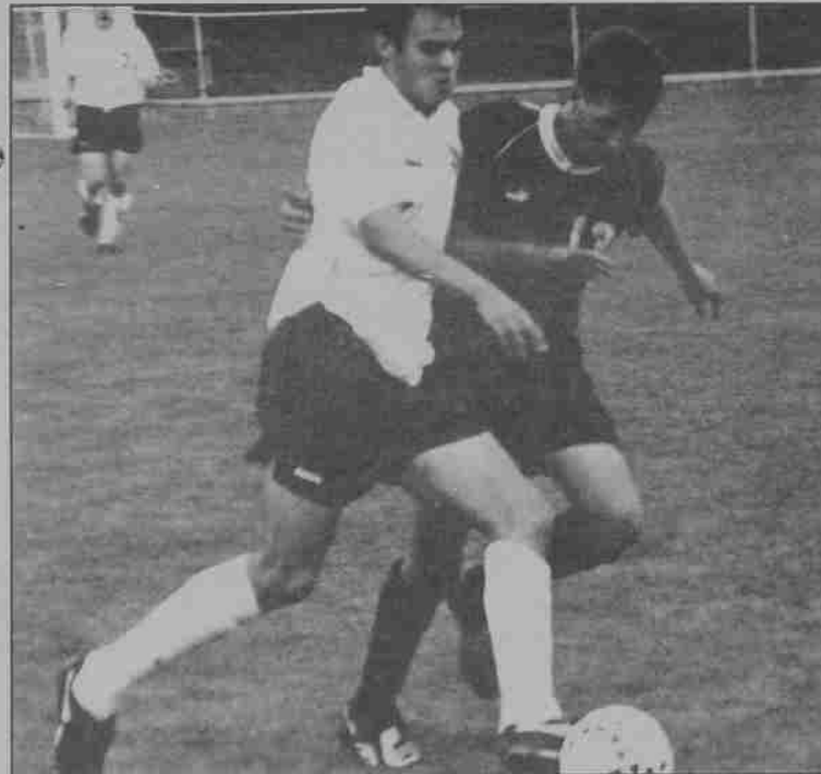
A Whitman defender crowds a Willamette player as he maneuvers the ball toward the goal in a recent game.