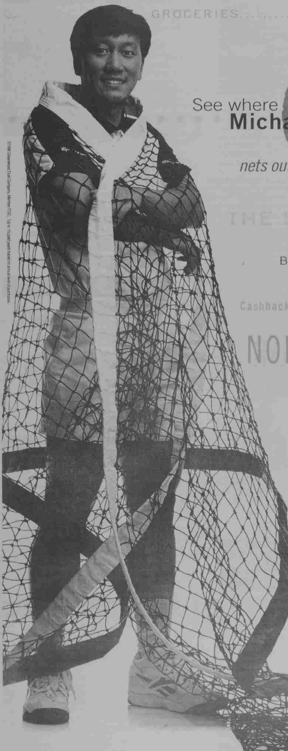
©1996 Discover Bank. Member FDIC. *Up to 1% cash back based on actual level of purchases.