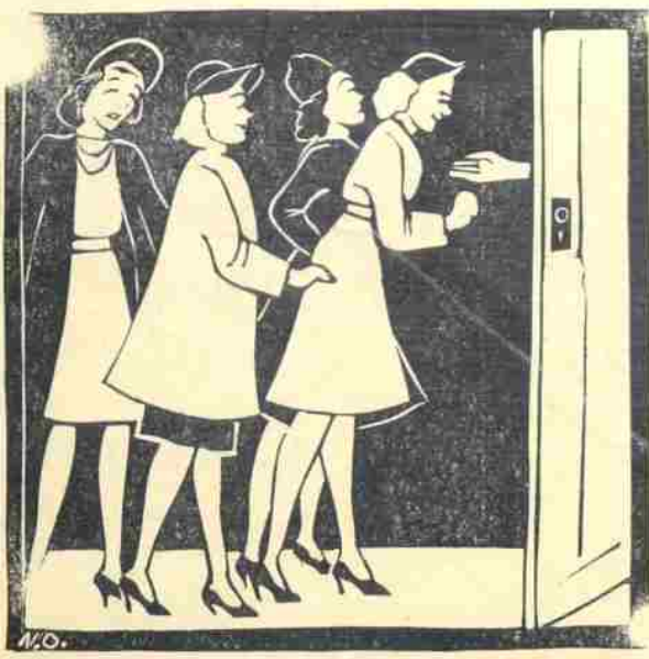
By NADINE ORCUTT