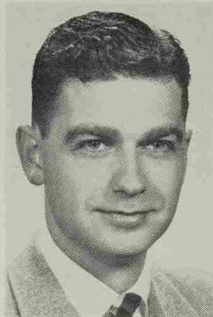
Mark Hatfield, '43 Baccalaureate Speaker