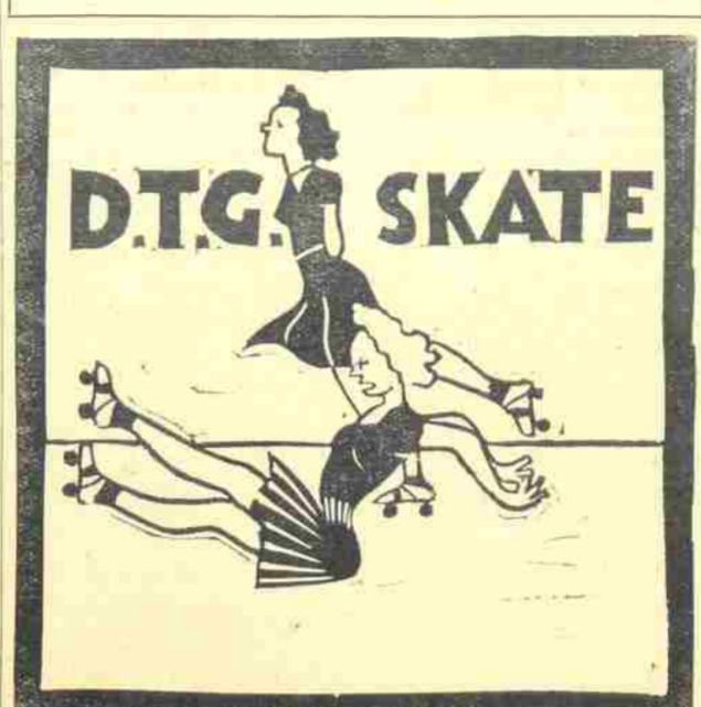
By NADINE ORCUTT