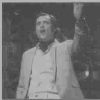
Jim Carrey stars in The Man on the Moon .

A good, solid cast led by a phenomenal Jim Carrey is not enough to save this film from a script as unsure of its identity as the main character. Now, this may have been the purpose of this Andy Kaufman biopic, but it feels more like fence sitting. Although her part is far less juicy than in The People vs. Larry Flint , Courtney Love proves her previous performance was not just a fluke.