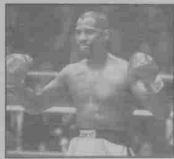
Denzel Washington plays Rubin Carter in the critically acclaimed movie The Hurricane .

Denzel Washington reminds us what an amazing actor he is. This heavy, searing drama recounts the ordeal of Rubin "The Hurricane" Carter, the boxer wrongly convicted of murder who served 22 years in prison. The film is long (like everything else out right now) but it packs multiple emotional wallops.