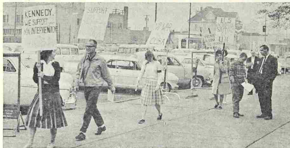
Several Willamette students demonstrated for three hours in front of the Salem Post Office last Friday, advocating negotiation and cooperation with the UN as alternatives to armed intervention in Cuba. The demonstrators handed out leaflets and talked with passers-by.