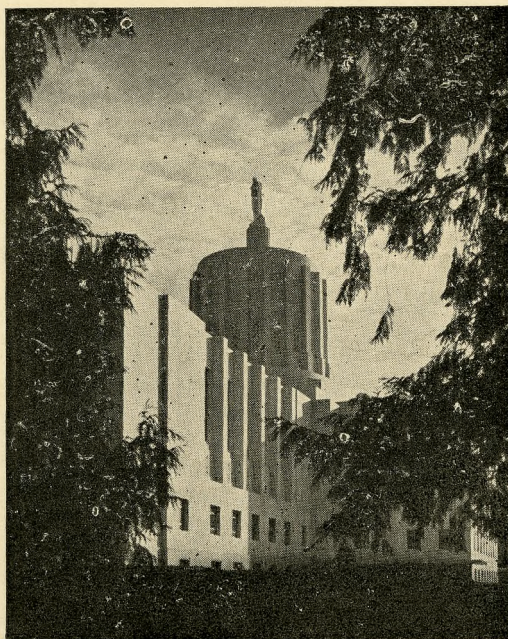
The New Oregon Capitol Viewed from Willamette's Campus