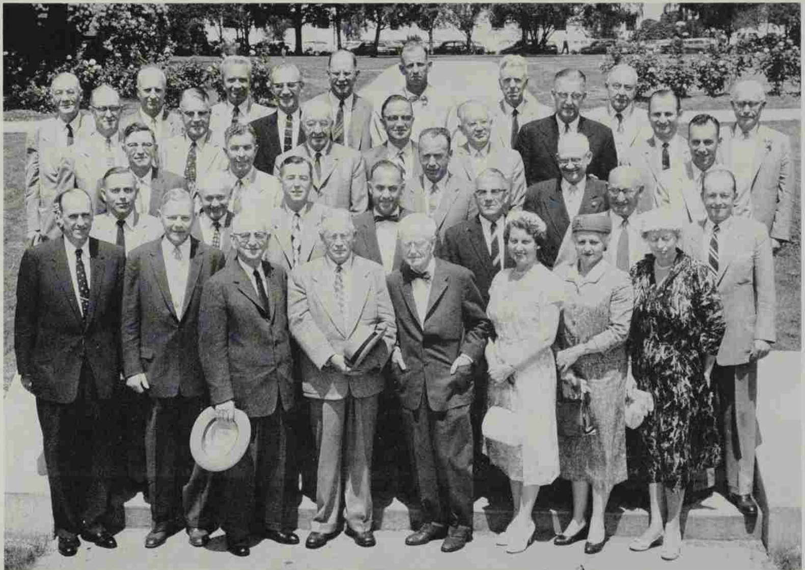
Members of the Board of Trustees attending meeting, June 1