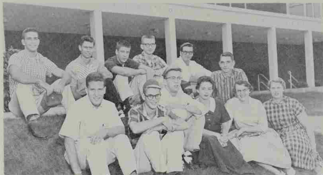
Freshmen following in the steps of their parents, who were former WU students.