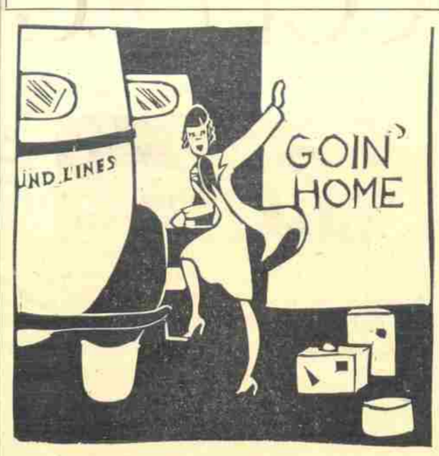
By NADINE ORCUTT