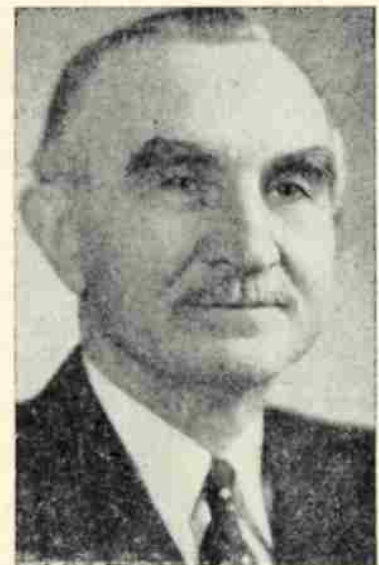
SENATOR WAYNE MORSE

This was the result of the Mock Convention's effort to stimulate in-