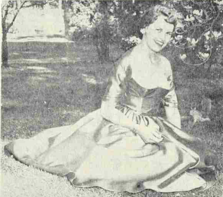
QUEEN MARGARET II