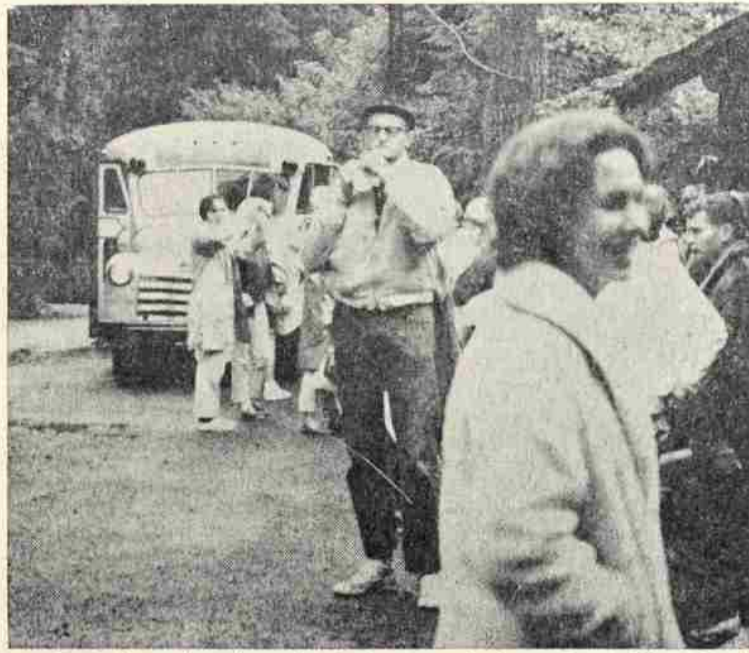
Confusion reigned as the freshmen arrived at Camp Silver Creek for the second annual pre-orientation camp.

The State Library Board of Trustees wished the public to know that they hope these reductions in service would be of a temporary nature and that if the October 15 tax referral is favorable, full service may be resumed.