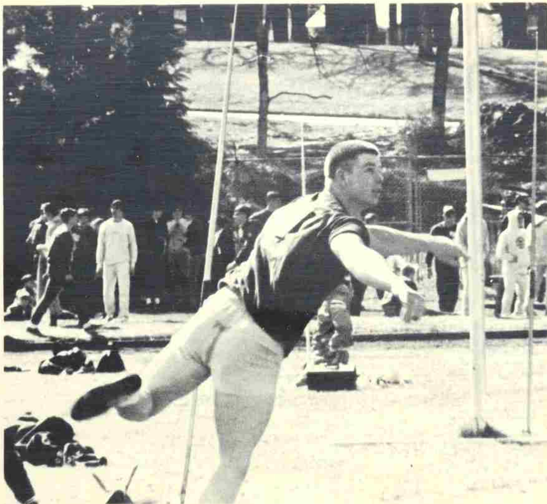
IN LAST Saturday's dual meet with Pacific Lutheran University from Tacoma, Washington, the Willamette Bearcats trounced PLU 100-44.

Representatives from the University of Oregon Dental School will be in Collins Hall, Room 213, on Monday, April 29. All students interested in making application to Dental School at any time in the future are invited to talk with these representatives between 4:00 and 5:30 P.M.