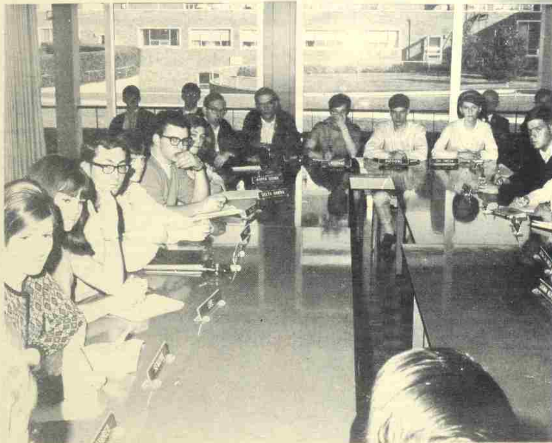
INTENT interest and concentration was on the faces of Student Senate members as they discussed the validity of the campus' recent stu-

dent body elections. The Senate voided the election results and decided to hold the elections again yesterday and today.