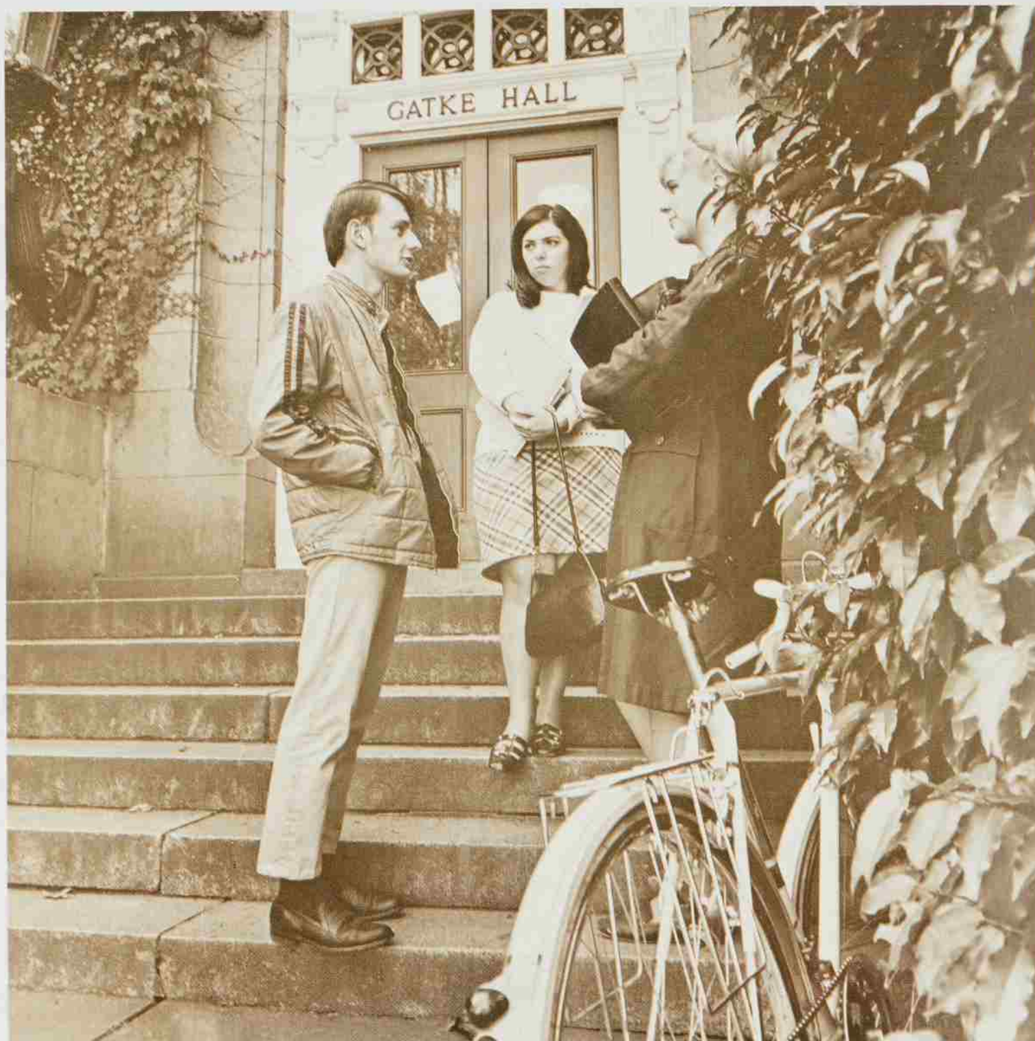
STUDENTS chat between classes outside Gatke Hall

RETURN POSTAGE GUARANTEED WILLAMETTE UNIVERSITY, SALEM, OREGON 97301