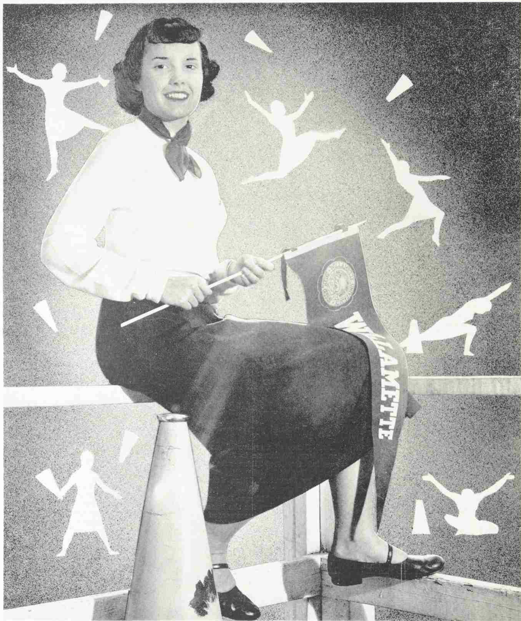
Miss Homecoming Hostess 1951