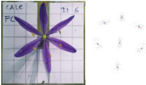
Fig. A Camassia leichtlinii flower from Fruitland Creek (left), one of the images contributing to a consensus diagram (right) of the seven landmark points with all recorded deviations. The consensus points depict the average morphology across all individuals, while the cloud of points surrounding them show each individual's deviation around that average.

Hybrid individuals often show phenotypes intermediate to their parents, making hybrid zones ideal for experiments on speciation. Species in the genus Camassia often co-occur in the same habitats. Previously presumed to not hybridize with each other, the radially symmetrical C. leichtlinii ssp. suksdorfii and the bilaterally symmetrical C. quamash ssp. maxima sometimes form evident hybrid zones that gradate from one species to the other. I used geometric morphometric analysis, a technique only relatively recently applied to botany, to quantify differences in shape and symmetry between populations of these two camas species and their putative hybrids. Results from geometric morphometric analysis of 220 floral images from two sympatric sites and two allopatric sites agreed with the categorization of these same plants based on traditional morphological characters. Principal component analysis revealed distinct species separation between parental types in all populations, but also evidence of hybridity. Sympatric populations were closer to each one another along the first principal component than allopatric populations, suggesting gene flow may be influencing evolutionary patterns in this genus.