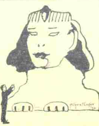
The W. U. Sphinx is still feeling very well, thank you.

The seniors who get good grades three years from now will be the freshmen who get good grades every day.