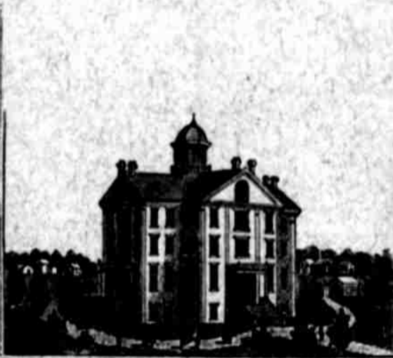
UNIVERSITY HALL, SALEM, OREGON.