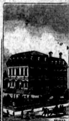
WOMAN'S COLLEGE, SALEM, OR.