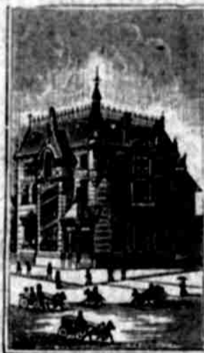
COLLEGE OF MEDICINE. PORTLAND, OR.

No. of Students in attendance last year, 436. Commencement, June 12, 1890. Fall term begins, September 1, 1890.