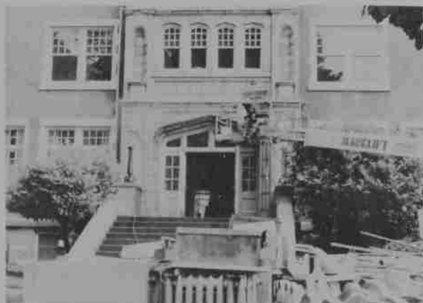
Above: Lausanne renovation underway. Below: Library excavation begins.

M eanwhile, in other parts of the campus: • Lausanne Hall is being renovated at a cost of $900,000. The 1920 student residence is being equipped with new plumbing, heating and electrical systems, new double-glazed windows and insulation, an upgraded fire alarm and sprinkling system, and new interior finishes