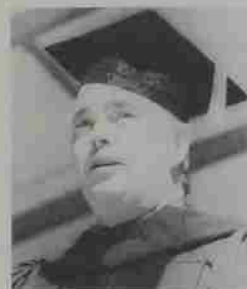
Frank H. Murkowski Doctor of Laws

Internationally recognized physicist with 38-year U.S. Navy research background; leading authority on underwater acoustics and deep submergence; pioneer of considerable national research in the marine sciences; president of Mackenzie Marine Science Consultants, San Diego.