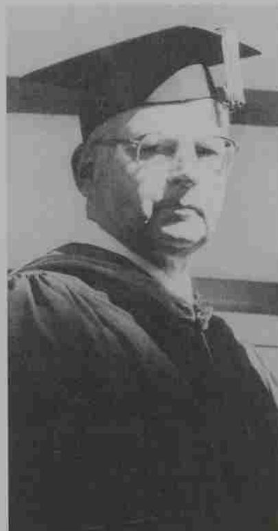
Purbrick: named to emeritus faculty

U.S. Senator from Alaska since 1980; current chairman of U.S. Senate Veterans Affairs Committee; active in development of legislation to encourage U.S. energy independence; former Alaska Commissioner of Economic Development; former president of Alaska Bankers Association and Alaska Chamber of Commerce.